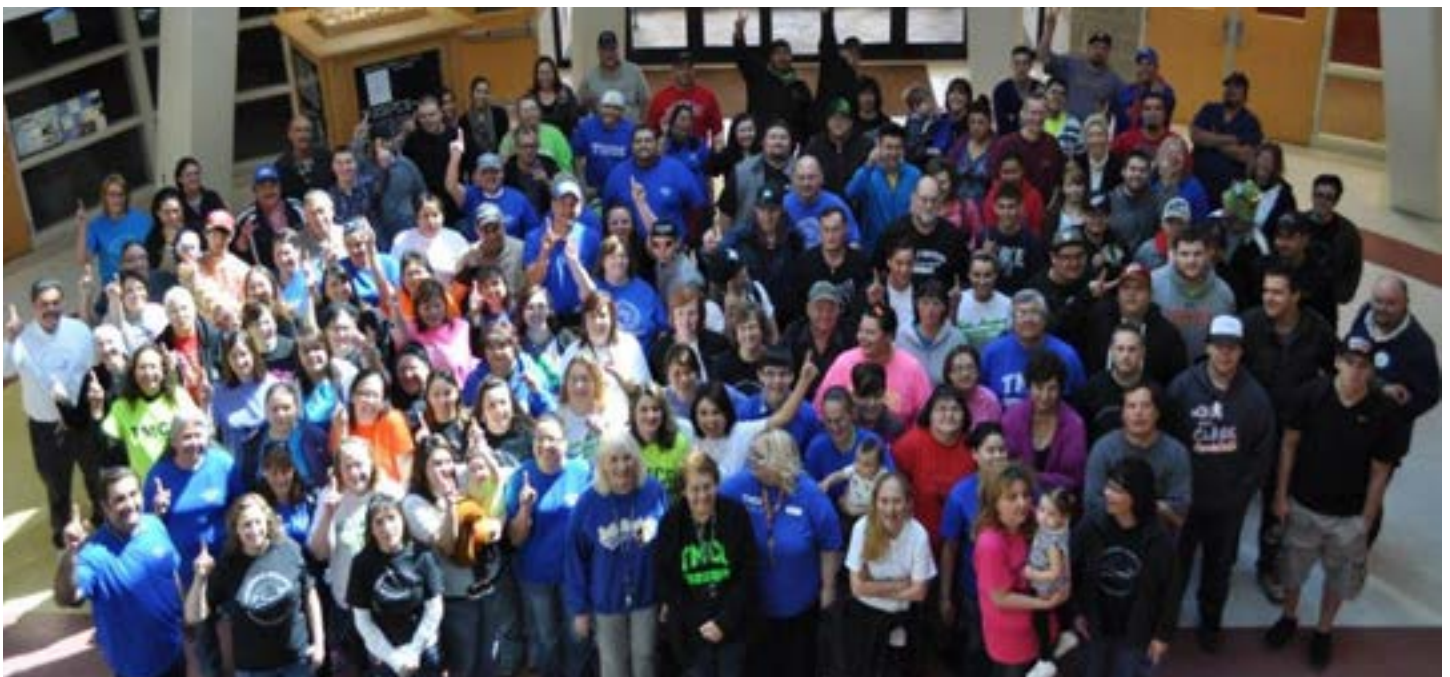
Students at the Turtle Mountain Community College